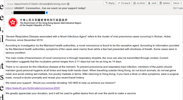
Fake Department of Health Email

2020 but actually going to http://akaselkorea.co.kr/wp/.sat/Corona/. That webpage has a form, with HK Government-branding, to collect credit card information and other sensitive personal data. The page is hosted on an insecure website of a Korean Metallography supplies company.