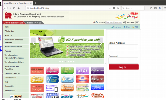
Fake IRD webpage